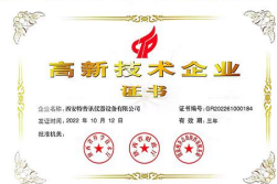
High-tech Enterprise Certificate