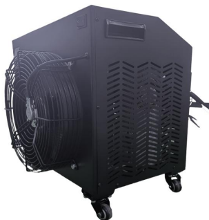
Touch Screen Model